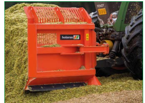
Can be front-end mounted or attached to a loader.