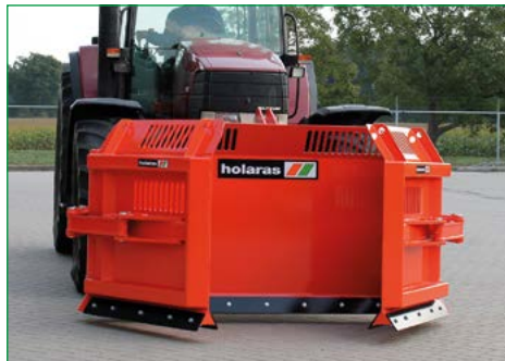
Both side panels fold in, giving the leveller a minimum transport width of 260 cm or 300 cm.