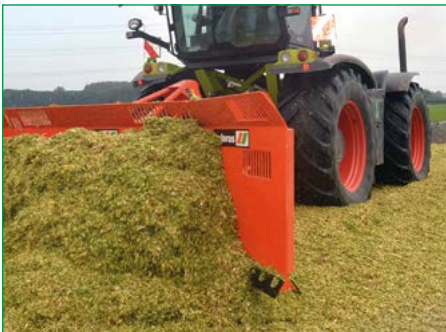
The leveller can be attached to the tractor's 3 point linkage.

If your tractor or loader does not have enough hydraulic spool valves to fully operate the maize leveller , the implement can be fitted with an electro-hydraulic operating system for optimum use. This system can be combined with a universal Holaras remote control, allowing the central and wireless operation of all maize leveller functions.