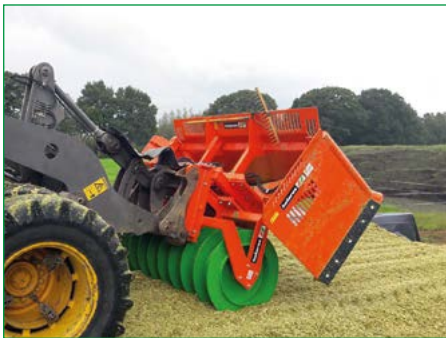
STEGO silage compactor